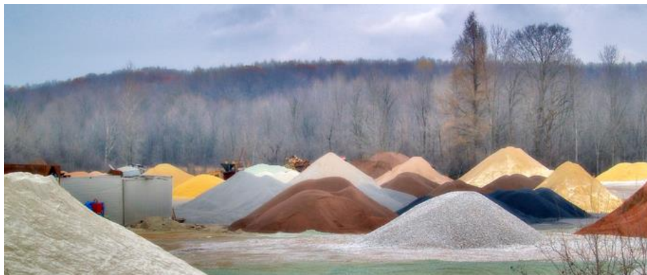
Figure 1. Different types of aggregates and sands.

We recognise that there is an international debate regarding what should and should not be considered sand. In this report, sand refers to both sands and aggregates. Aggregates is a generic term used for crushed rock, sand and gravel used in construction materials. Sands are granular materials composed of finely divided rock and mineral particles.