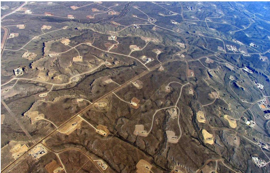
Figure 3. Fracking activities.

Construction is not the only sector to explore if we want to assess the responsibility of sand sourcing. Sand is also very valuable for fracking and the petroleum industry , as well as for transition to the green economy. Fracking, for instance, uses huge quantities of quartz-rich sand as a proppant to open the cracks from which natural gas is extracted ( around 1,800 tonnes of sand are used to dig one well ). In the green energy sector, photovoltaics need sand for their production, and the transition to a greener economy will mean producing more solar panels to generate clean energy. Similarly, if we want to start replacing plastic bottles with glass bottles, we will need more sand as well. Minerals extracted from sand are also used to develop microchips, used in mobile phones, laptops and tablets; toothpaste, sunscreen, cosmetics, and even in wine production .