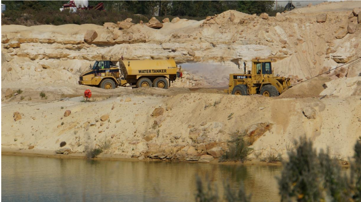
Figure 4. Silica sand mining, Minnesota.